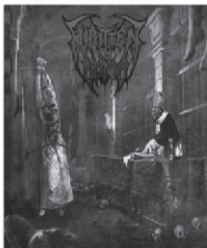
WRITTEN IN BLOOD